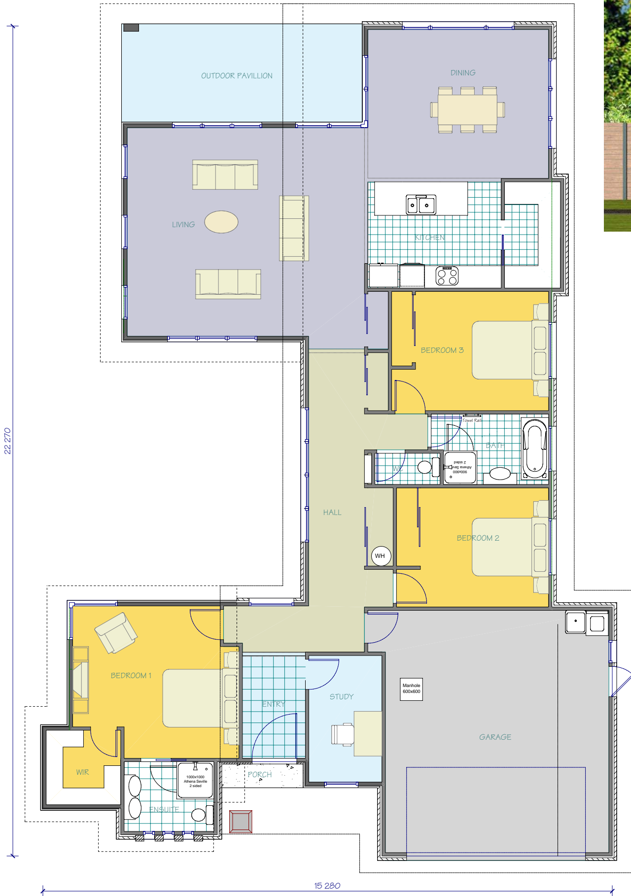
FLOOR PLAN 1:100